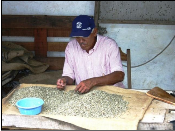
Don Justo beans are handpicked for quality.

Buying coffee through this project also promotes sustainable community and economic development. A large portion of the proceeds go to projects designed and organized by local residents. These projects have included: support for small farmers; maintenance and repair of community structures; food packets and assistance for elderly or others with no other resources. General medical, educational, economic and social justice issues are also addressed with the proceeds.